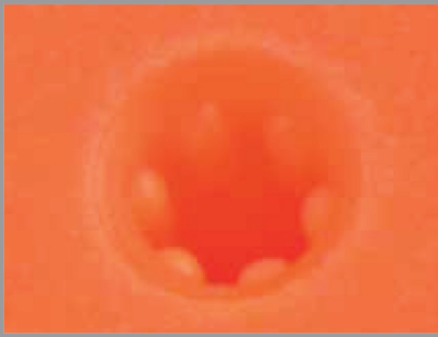
Patented starburst hole design