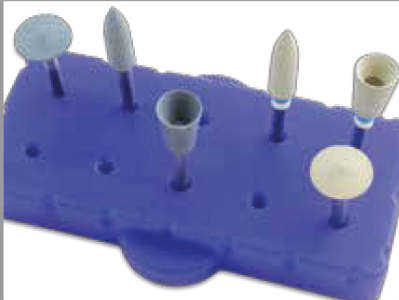
Resists high temperature and distortion