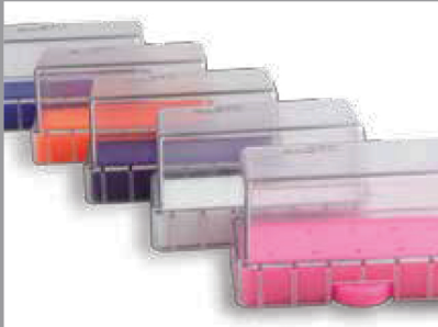
Assorted colors for practice organization