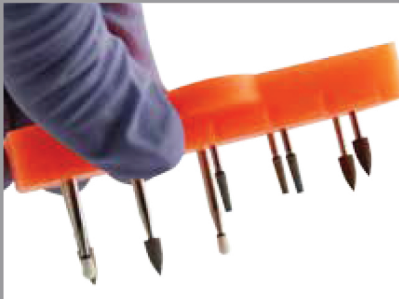
Mix and match burs – holds FG, CA, and short shank